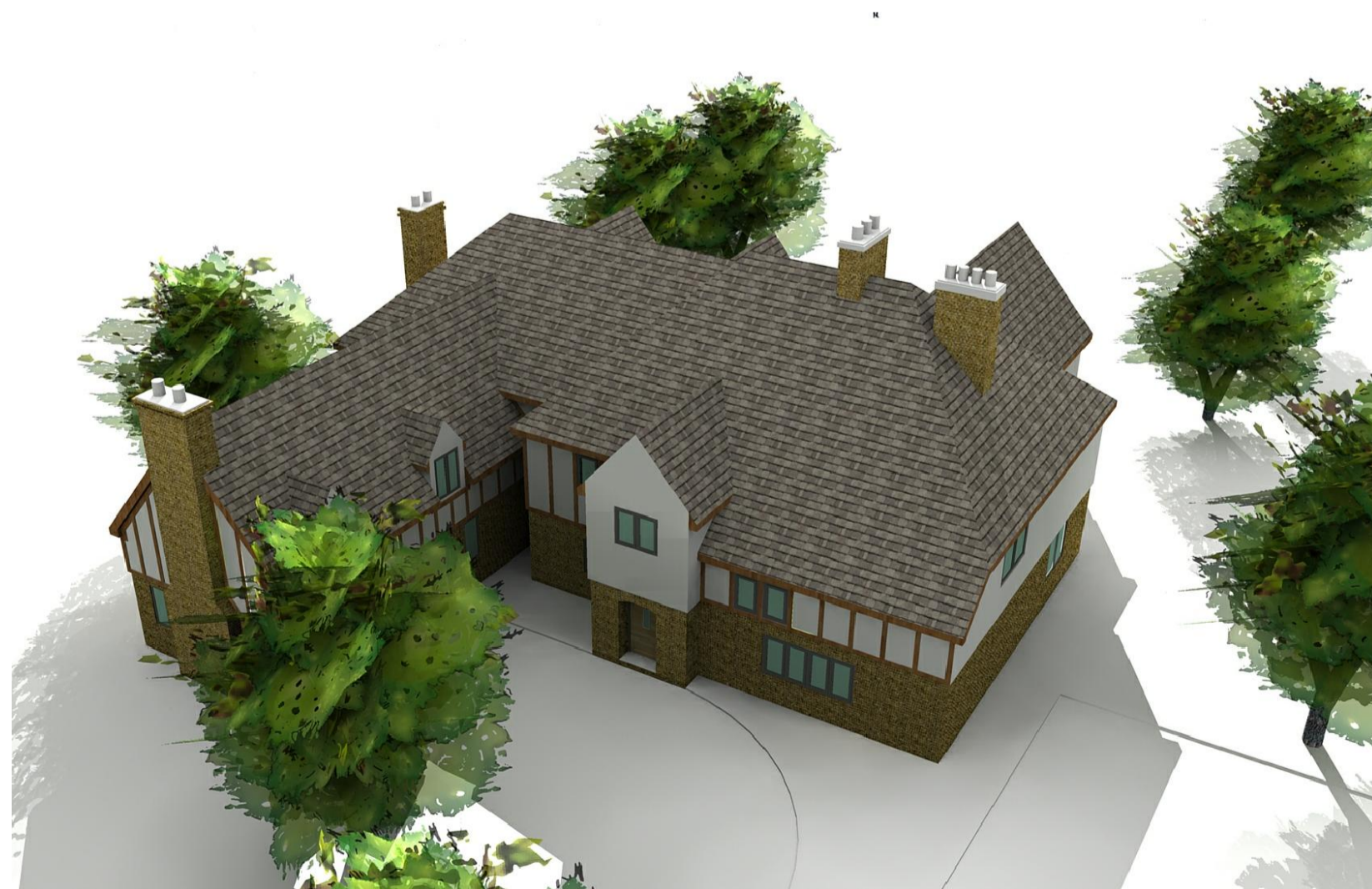
PROPOSED PERSPECTIVE VIEW

This drawing is copyright and shall not be reproduced nor used for any other purpose without written permission of the author.